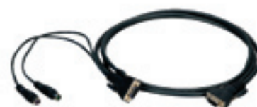
● IKVM-CBS Cable